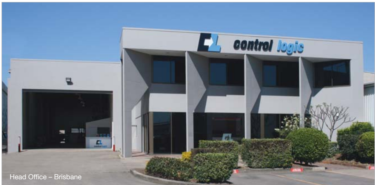
Head Office – Brisbane

Email: sales@control-logic.com.au :: www.control-logic.com.au