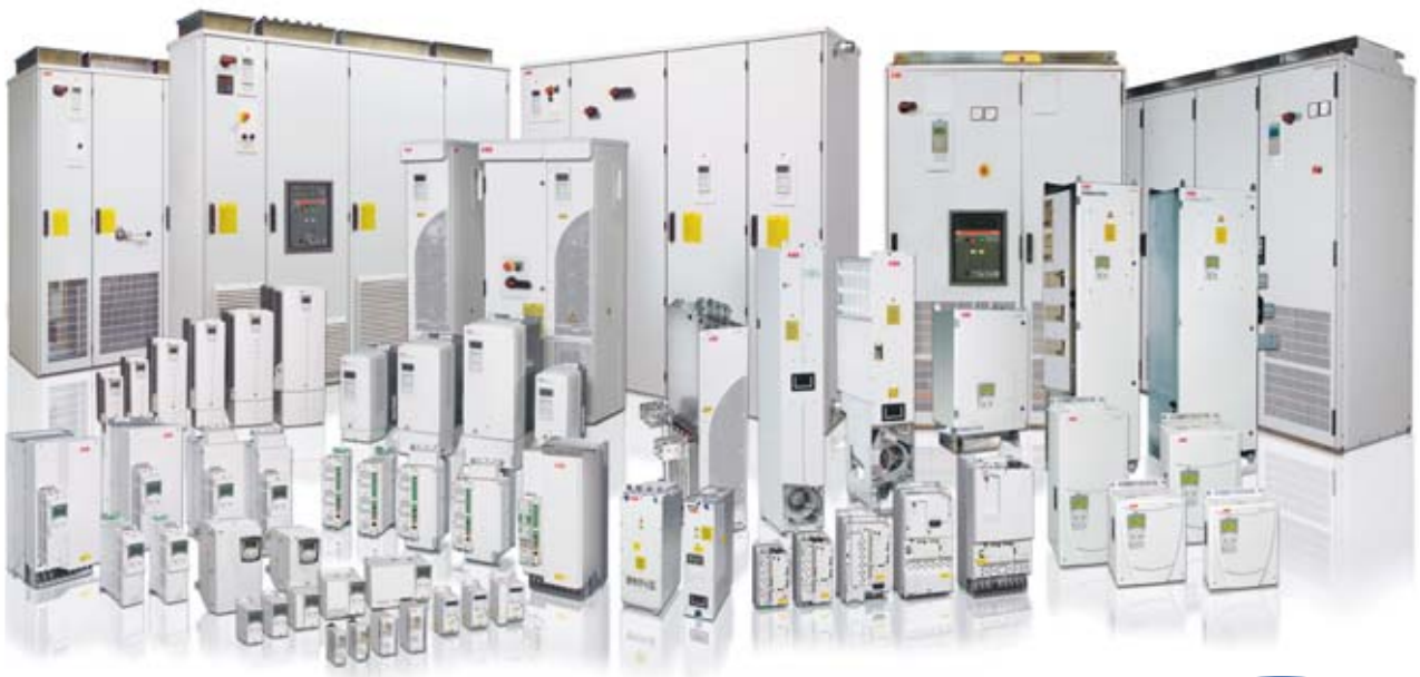
ABB drives alliance